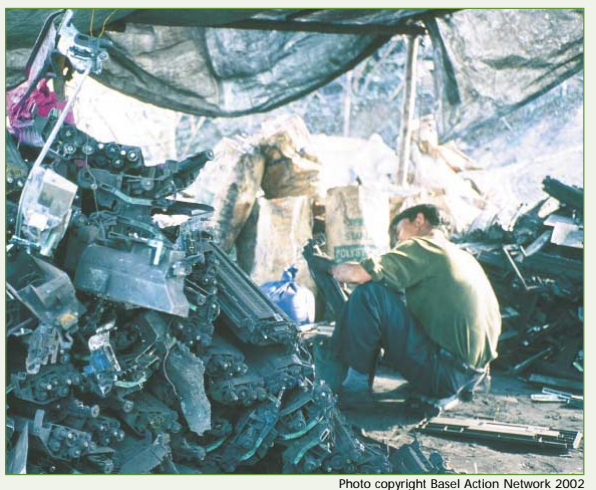
A laborer in Guiyu, China, with his arms black with toner, sweeps toner out of cartridges for possible reuse.

Puckett said that the data sheets are based on the black toner, and contents of color toner are listed as "trade