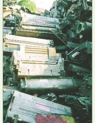
Stacks of color printer cartridges along the roadside in Guiyu.